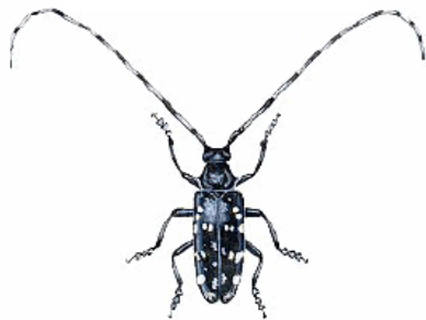
Asian longhorned beetle

Seed Testing Program enforces the Seed Law, where official seed samples are taken from stores and brought to the laboratory for testing; and provides a seed testing service where samples are brought into the laboratory for analysis. Labels on seed packages are inspected at stores throughout the state. This program ensures that quality seed is offered to Delaware consumers.