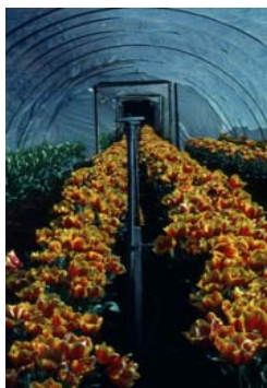
Nursery Inspection Unit inspects greenhouses for plant pests.

Cooperative Agricultural Pest Survey program is conducted in cooperation with USDA and the Univ. of DE Cooperative Extension Service. We survey for exotic plant pests and other pests of export significance to help facilitate the export of Delaware agricultural products. The National Agricultural Pest Information System (NAPIS) database for Delaware is maintained by Plant Industries. Bio-control programs for invasive noxious weeds, such as purple loosestrife, are also being developed and implemented.