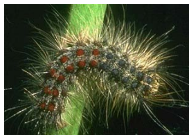
Gypsy Moth Spray Program is one program available to landowners.

Plant Industries is the plant and plant pest regulatory enforcement authority in the State. Our mission is to protect agriculture, the environment and citizens from the damaging effects of plant and honeybee pests and noxious weeds while facilitating domestic and international trade of plants, plant products, grain, seed, and agricultural commodities. Some of the people and businesses served by Plant Industries in Delaware are farmers, beekeepers, nursery growers and dealers, fruit growers, university and industry researchers, grain elevator operators, stores that sell seed, consumers, exporters of Delaware agricultural products, people with gypsy moth problems, people moving houseplants out-of-state, and people wanting pest identification services.